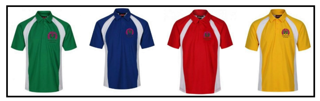
Joseph Leckie House Polo Shirt