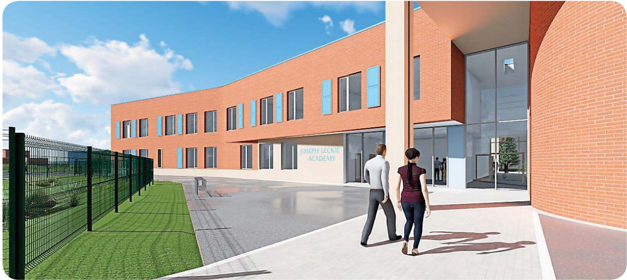
Artist's impression of the new teaching facilities

Joseph Leckie Academy has been awarded £3.89 million for world class teaching and learning facilities.