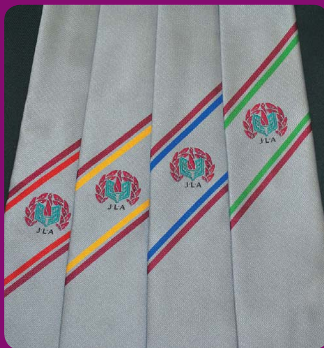
The Joseph Leckie Academy tie range

When students have had any other part of their body pierced, parents should be aware that those students will be required to remove any rings or studs whilst on site due to health and safety requirements.